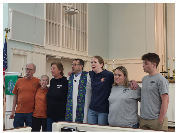
ASP – please pray for our Appalachia Service Project mission trip participants and those they serve in Knott County, Kentucky. They return home on July 2<sup>nd</sup>.

Sunday Worship – a friendly reminder that there will be only one service at 10:00 A.M. through the summer.